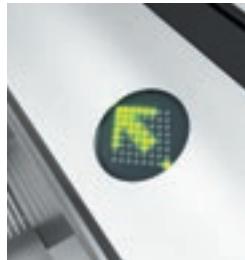
Traffic light mowing arrow